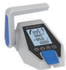
Evo Top Mount Control

You could always find a control that best fits your boat.