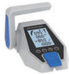
Evo Top Mount Control

You could always find a control that best fits your boat.